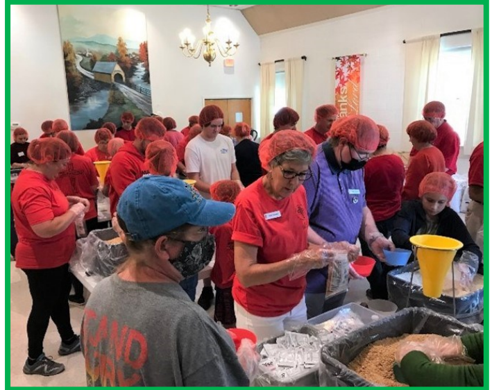
Volunteers from Chester UMC packing 10,000 meals on September 25, 2022.