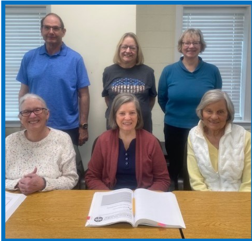
Chester UMC's Stephen Ministers in Training